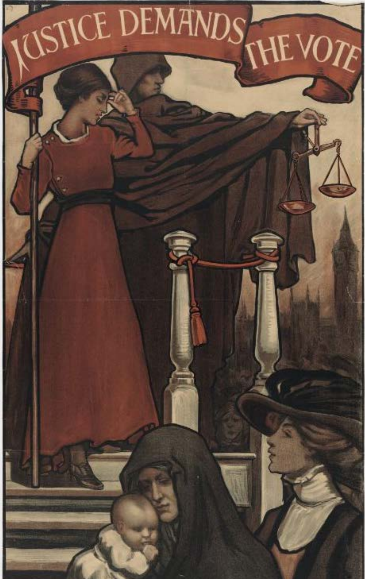
"Justice demands the vote" poster.